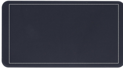
2. TOP (SCREEN)