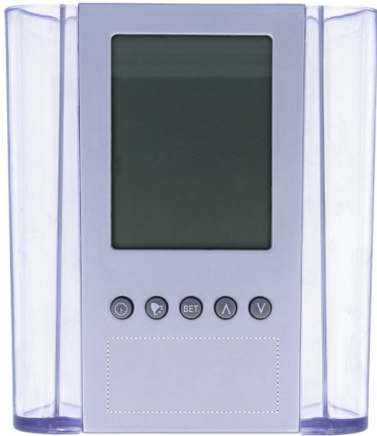
1. BELOW DISPLAY