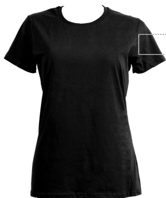
5. ARM LEFT