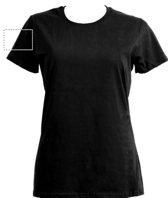
4. ARM RIGHT