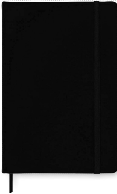
2. FRONT PD